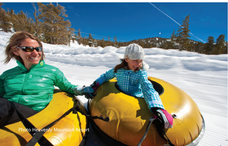
Photo Heavenly Mountain Resort