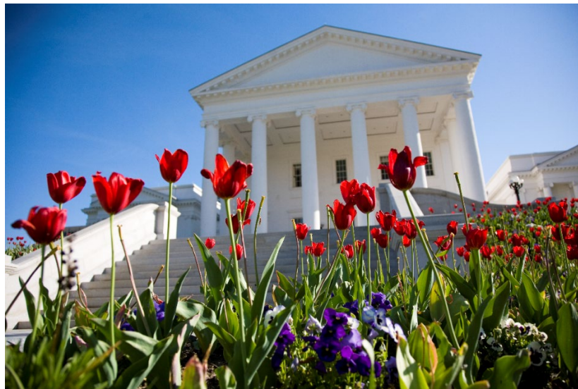
Virginia State Capitol, Richmond

Richmond, and the adjacent city of Petersburg , have played host to numerous small- and big-screen features, not the least of which was Steven Spielberg's LINCOLN , which won an Academy Award for Production Design, while Daniel Day-Lewis, whom portrayed Abraham Lincoln, took home the Best Actor award. There are so many fantastic selfie spots for this flick there are guided tours, including a Segway Tour , that covers Lincoln's path while in the state capital.