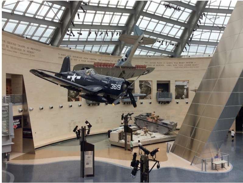
National Museum of the United States Marine Corps

Richmond, and the adjacent city of Petersburg , have played host to numerous small- and big-screen features, not the least of which was Steven Spielberg's LINCOLN , which won an Academy Award for Production Design, while Daniel Day-Lewis, whom portrayed Abraham Lincoln, took home the Best Actor award. There are so many fantastic selfie spots for this flick there are guided tours, including a Segway Tour , that covers Lincoln's path while in the state capital.