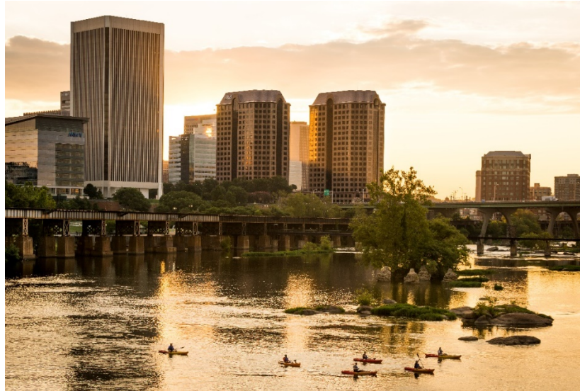
James River, Richmond

Renee Zellweger won the Oscar in 2004 for Best Actress in a Supporting Role for her work in Cold Mountain alongside Jude Law and Nicole Kidman. The movie was filmed in Richmond and nearby Williamsburg. Easy selfies can be secured on Belle Isle , in the James River in the very heart of Richmond – also a great place for hiking, biking, kayaking and white-water rafting.