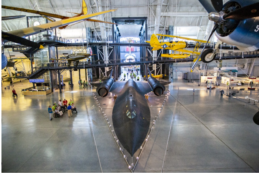
The Steven F Udvar-Hazy Center

Just 20 miles down the road is McLean , home to Langley and the CIA, and where parts of Argo were filmed. The movie starring and directed by Ben Affleck received the 2013 Academy Awards for Best Picture, Adapted Screenplay, and Achievement in Film Editing. While you likely can't gain access to the CIA (unless you're an agent, that is!) you can grab a selfie outside the gates. Plus, there is lots to do in nearby Tysons Corner , home to some of the best shopping in the capital region, not to mention the new Capital One Center where you can grab a craft beer at The Perch or take in a little live music, comedy or even a Broadway show . Tysons Corner is also home to four Metrorail stations, making it the perfect home-base for travels around northern Virginia.