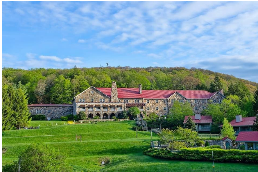
Mountain Lake Lodge

have you believe in the movie) Mountain Lake Lodge is the original Kellerman's, and as soon as you drive up, you'll feel that 'lights, camera, action' energy. The flick received an Oscar for Best Music, Original Song for " (I've Had) The Time of My Life " and you will have the time of your life at one of the Lodge's Dirty Dancing Themed Weekends . There's no better way to step into Johnny or Baby's shoes and you're guaranteed to get the selfie of a lifetime. Even if you're not up for the full dancing experience, a stay at the resort - even in Baby's Cabin! – offers a wealth of events and outdoor activities in one of the east coast's most breathtaking settings.