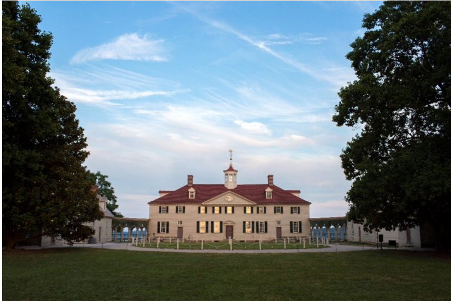
George Washington's Mount Vernon