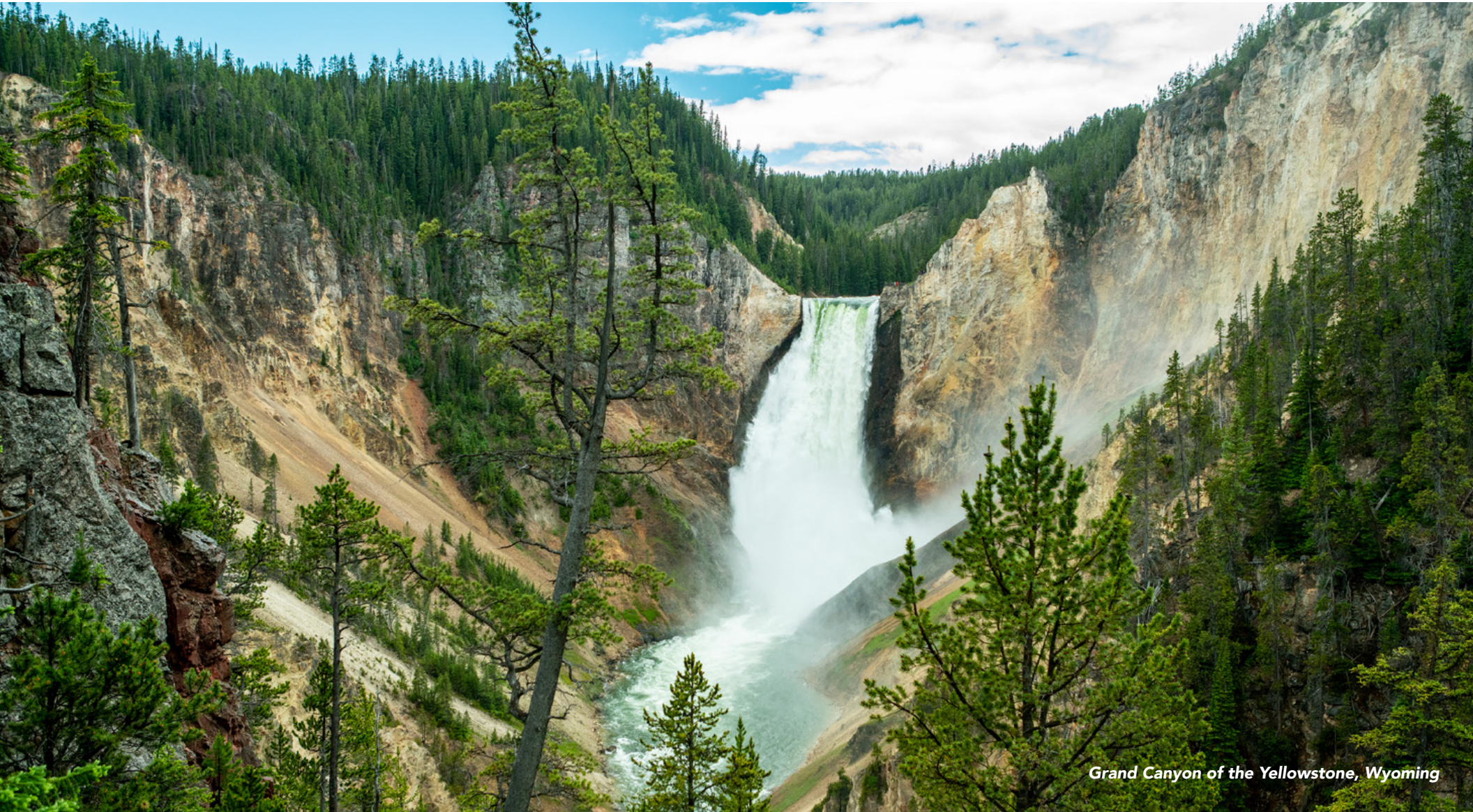
Grand Canyon of the Yellowstone, Wyoming