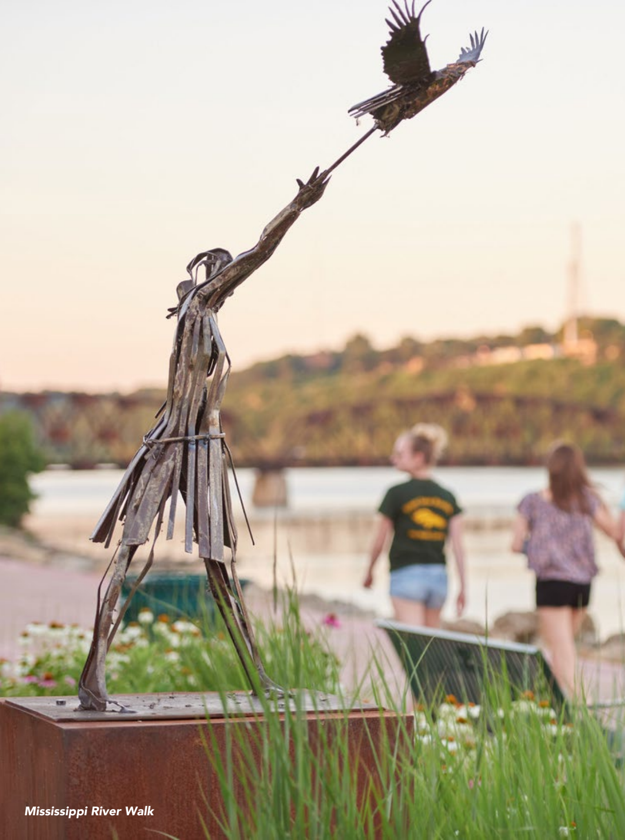
Mississippi River Walk