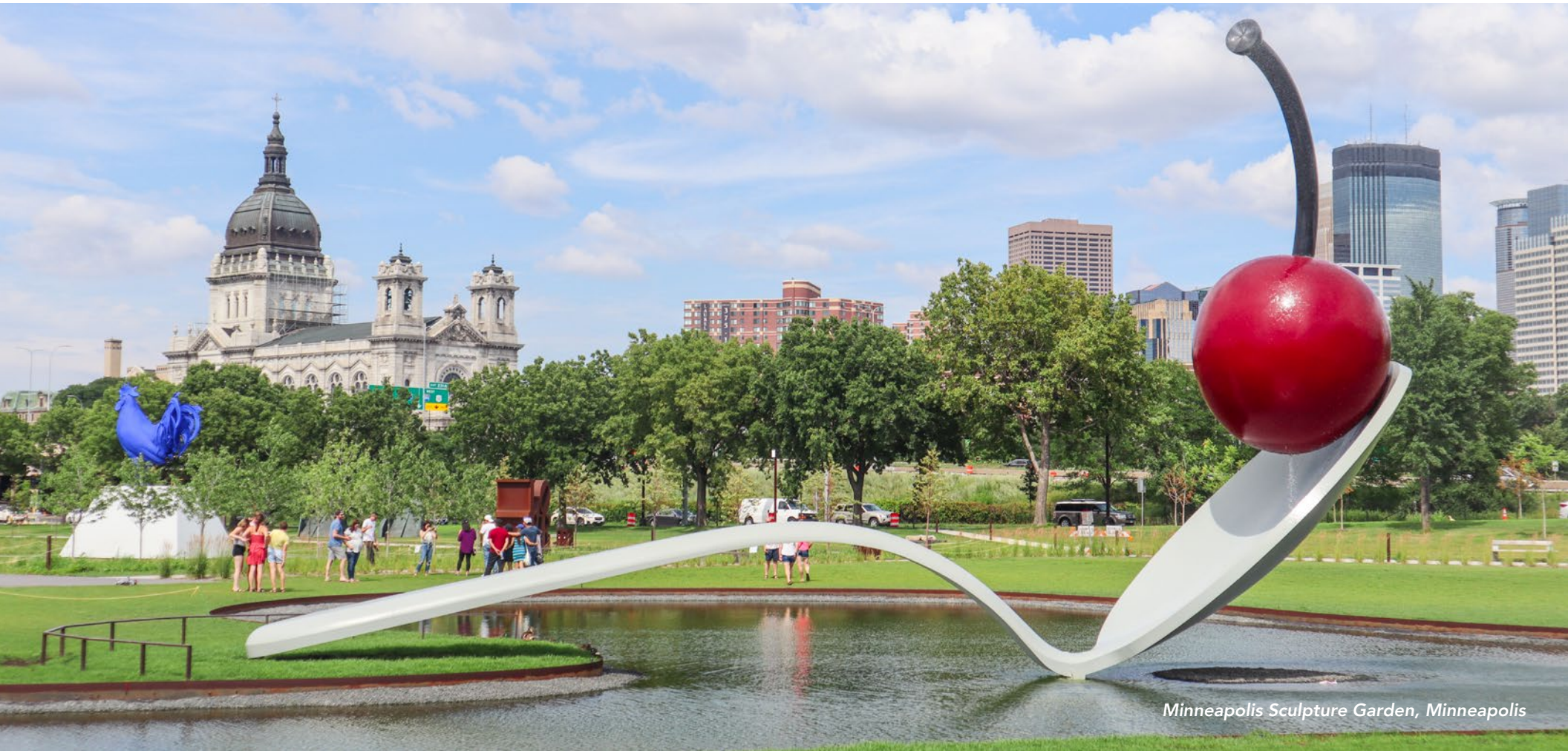
Minneapolis Sculpture Garden, Minneapolis