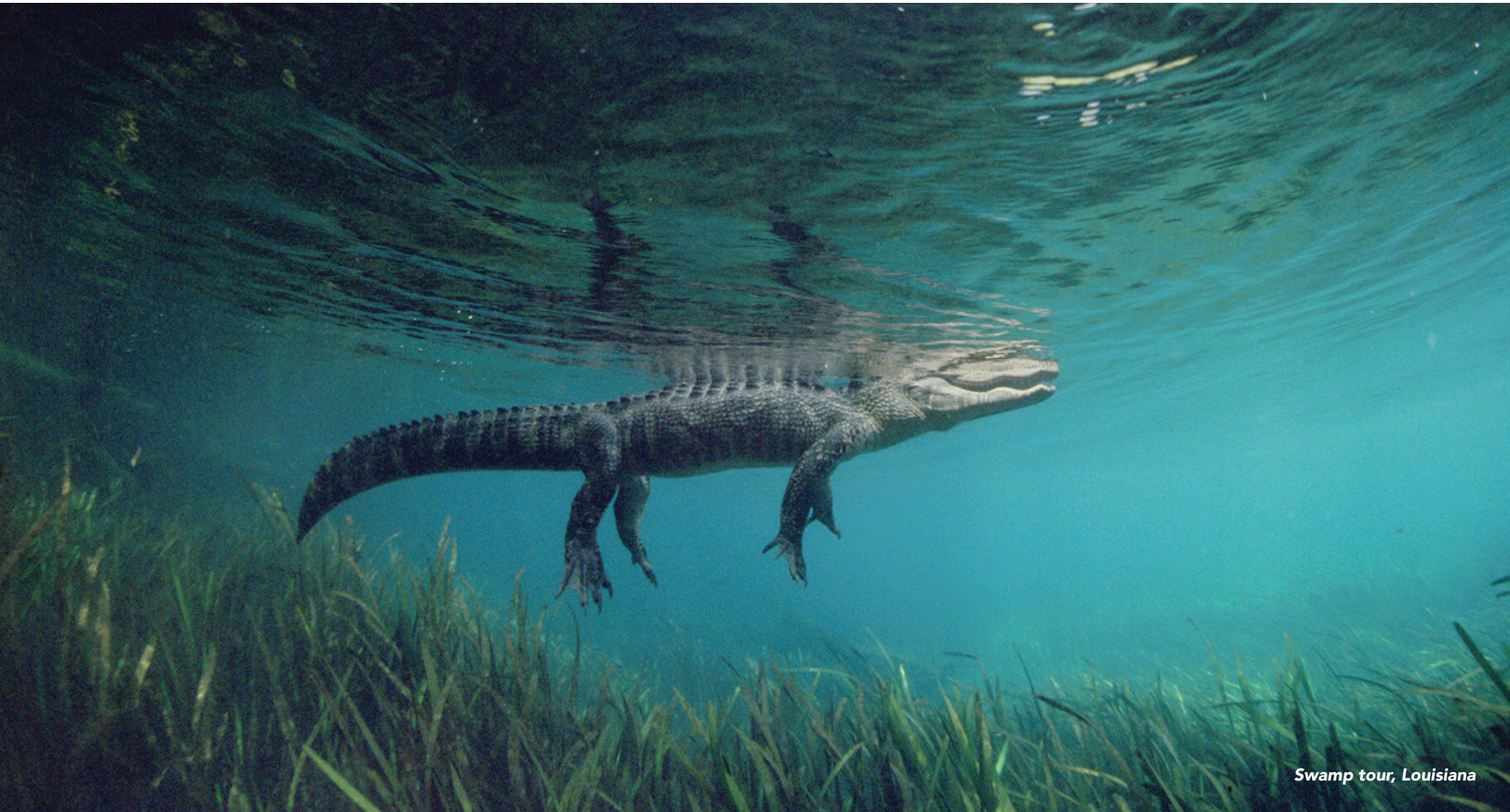
Swamp tour, Louisiana

For more trip inspiration and travel ideas throughout the USA, go to: VisitTheUSA.com