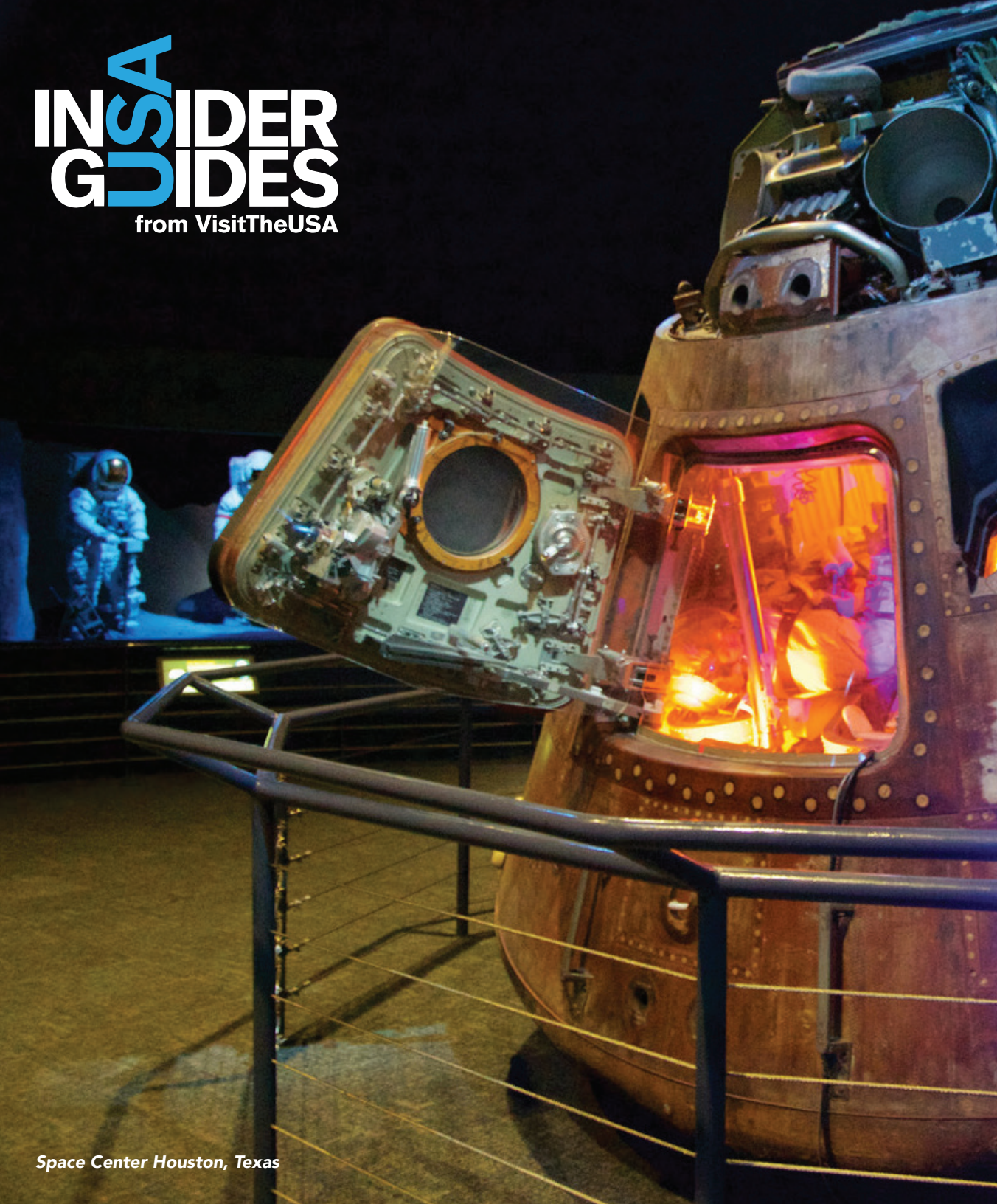
Space Center Houston, Texas