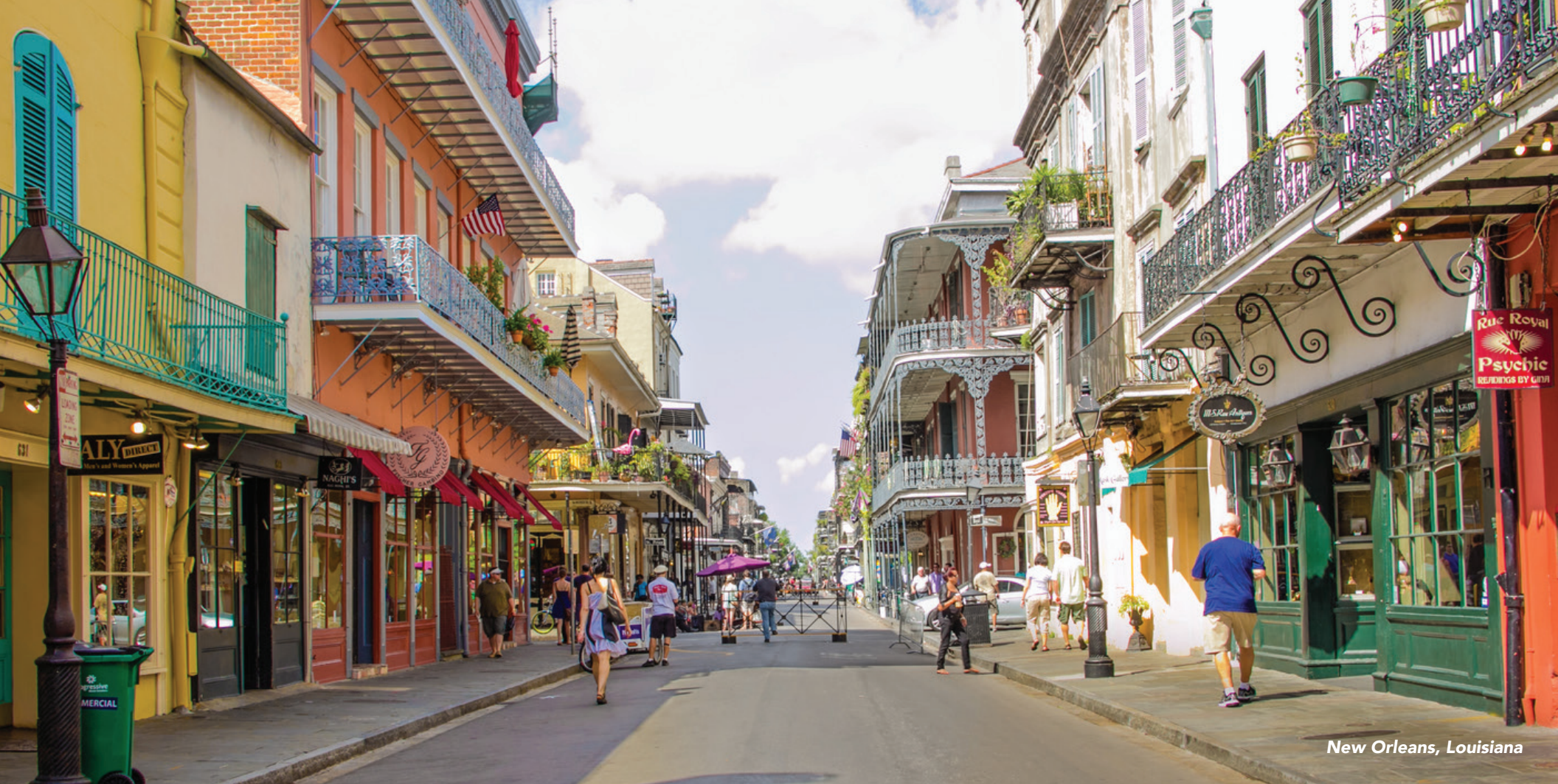
New Orleans, Louisiana