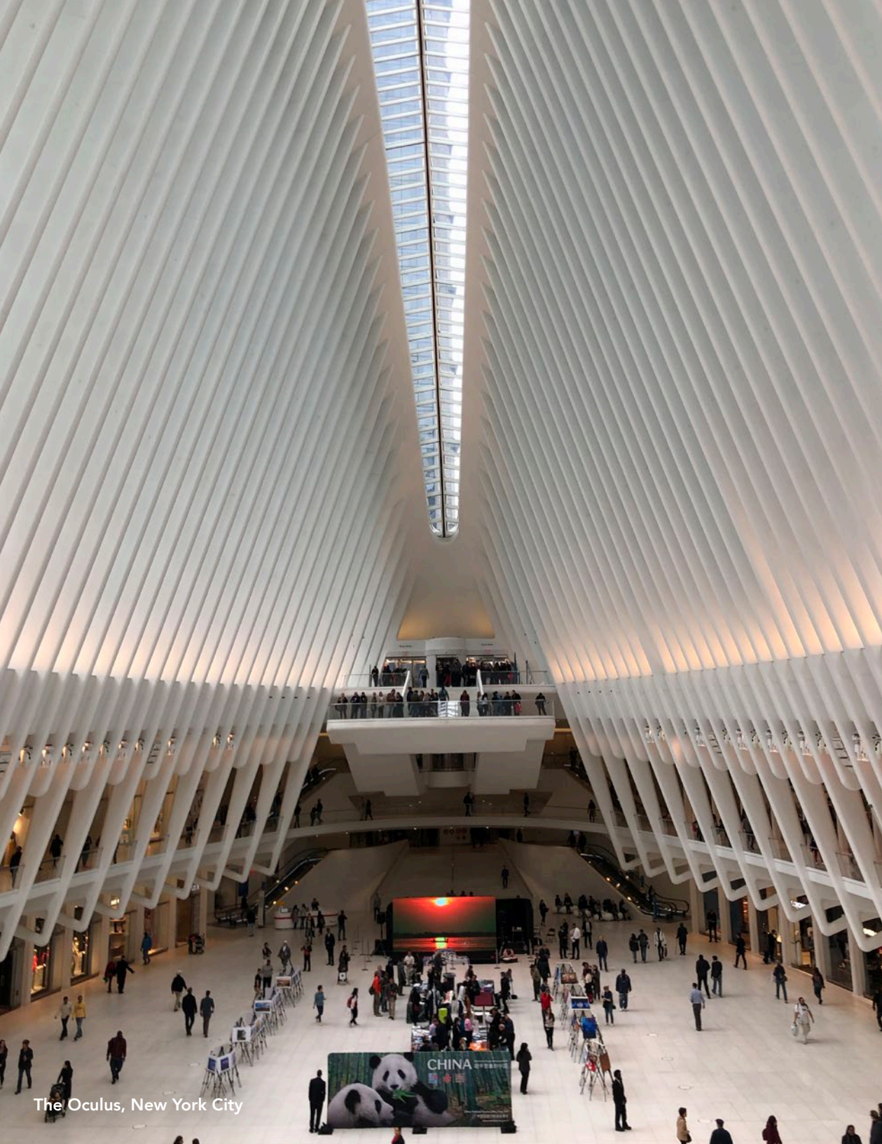
The Oculus, New York City