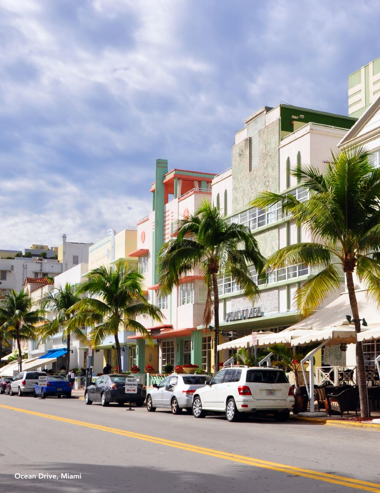
Ocean Drive, Miami