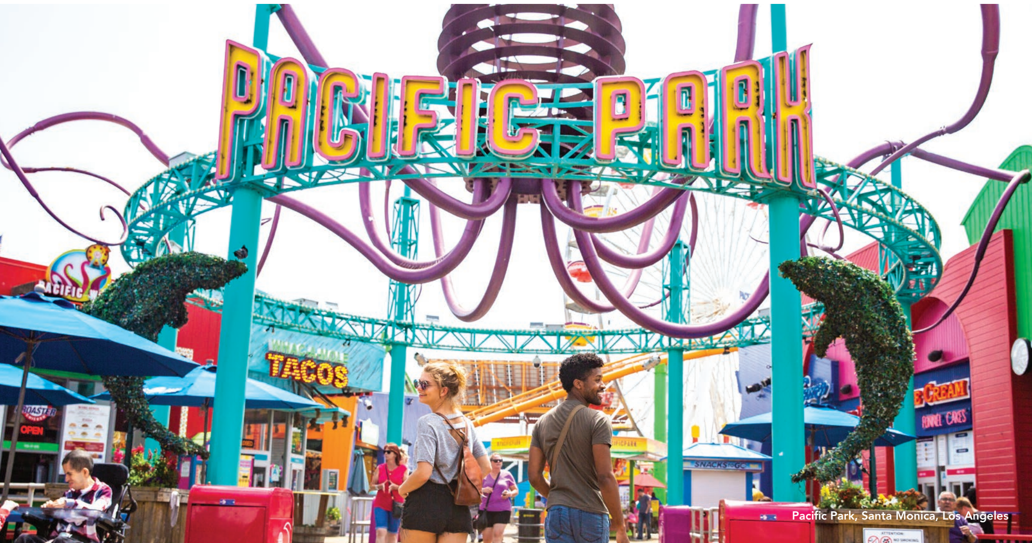
Pacific Park, Santa Monica, Los Angeles