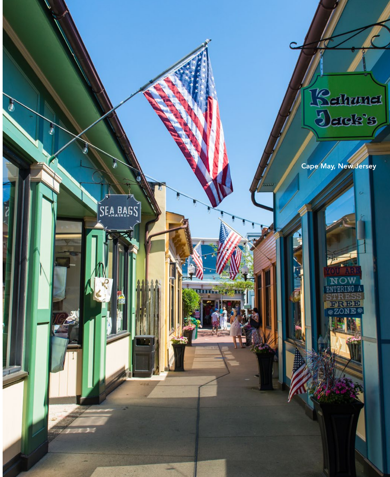
Cape May, New Jersey

See the best of the USA while embarking on an exciting shopping excursion. From flagship stores in New York City to boutiques in Miami Beach and the neon-lit grandeur of Las Vegas, the diversity of shopping experiences will astound you. Hunt for bargains at outlet malls, buy haute couture from designers and seek out specialty items at locally owned shops. Of course, you'll want to leave plenty of time to visit landmarks and attractions in each exciting city. To get you started, consider visiting top-notch shopping destinations in these 10 U.S. states.