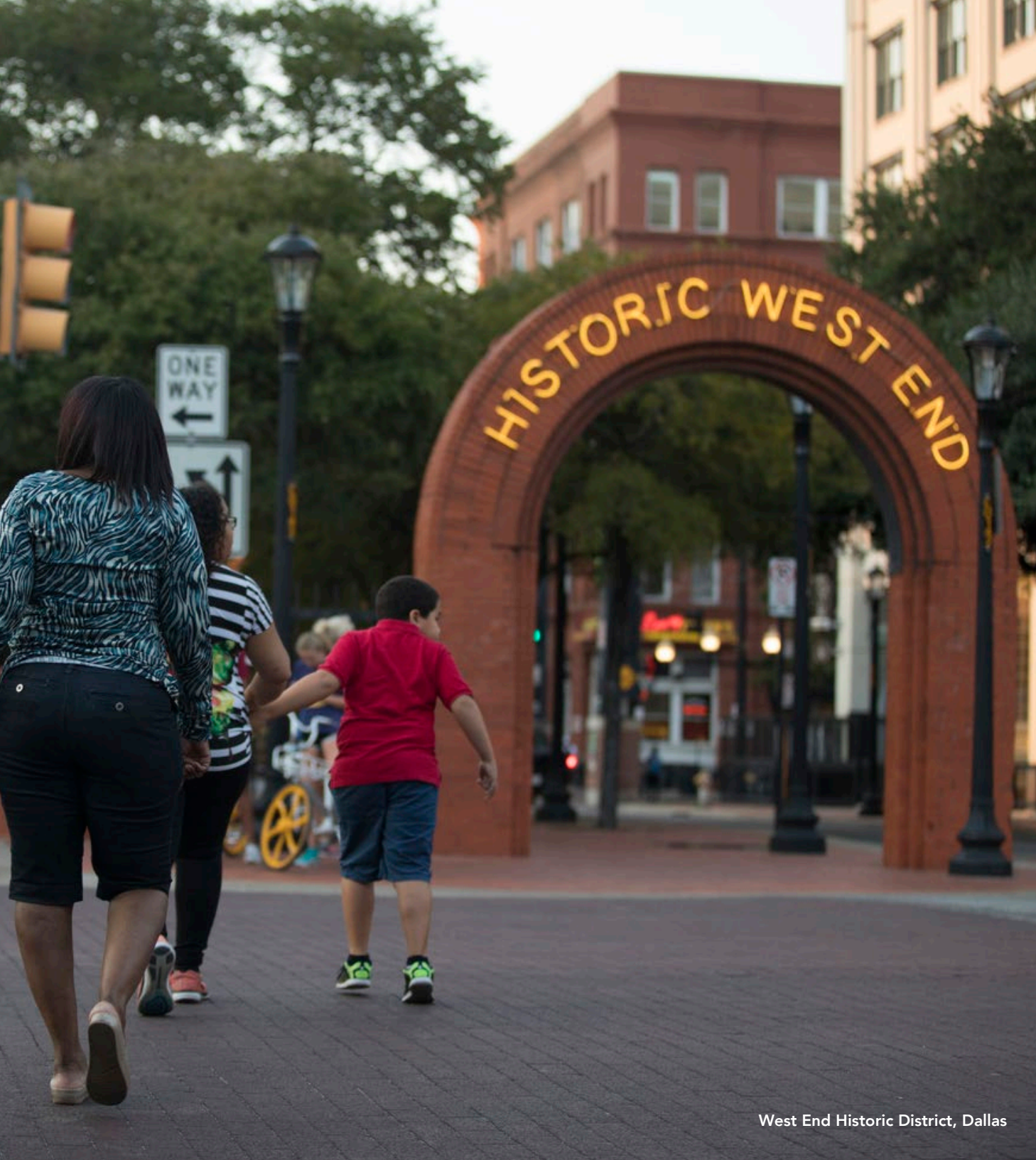
West End Historic District, Dallas