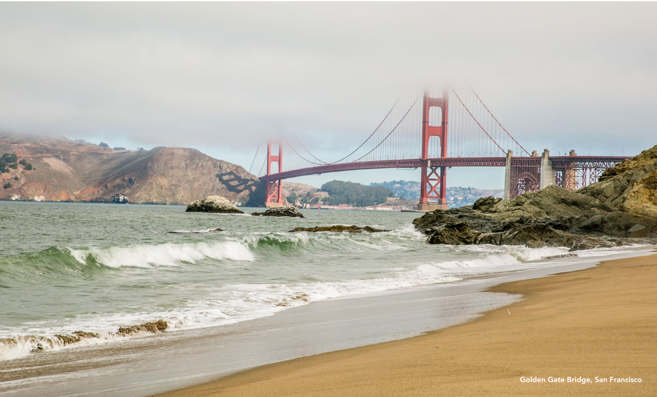
Golden Gate Bridge, San Francisco