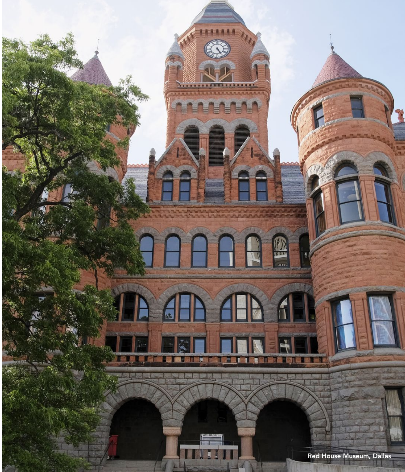
Red House Museum, Dallas

Just north of Dallas-Fort Worth International Airport, Grapevine Mills features over 180 stores such as True Religion Outlet, Under Armour, the Children's Place, Sears Outlet, Puma Outlet, Old Navy Outlet, OshKosh B'gosh, Nike Factory Store and Neiman Marcus Last Call. Take a break for sustenance at Chuck E. Cheese's, Rainforest Café or Great Wraps. The mall is also home to the Sea Life Grapevine Aquarium and Legoland Discovery Center as well as a mini train ride and carousel. Finish the day by following the Grapevine Urban Wine Trail , tasting varietals at Cross Timbers Winery and Grape Vine Springs Winery , among others.