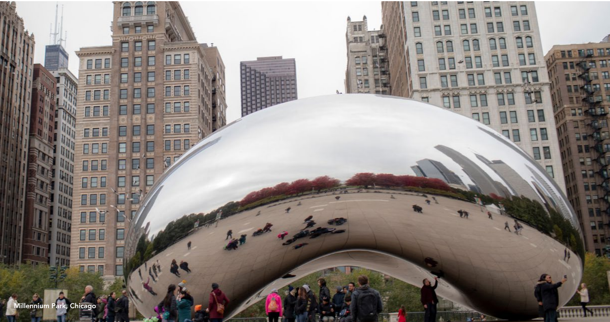
Millennium Park, Chicago