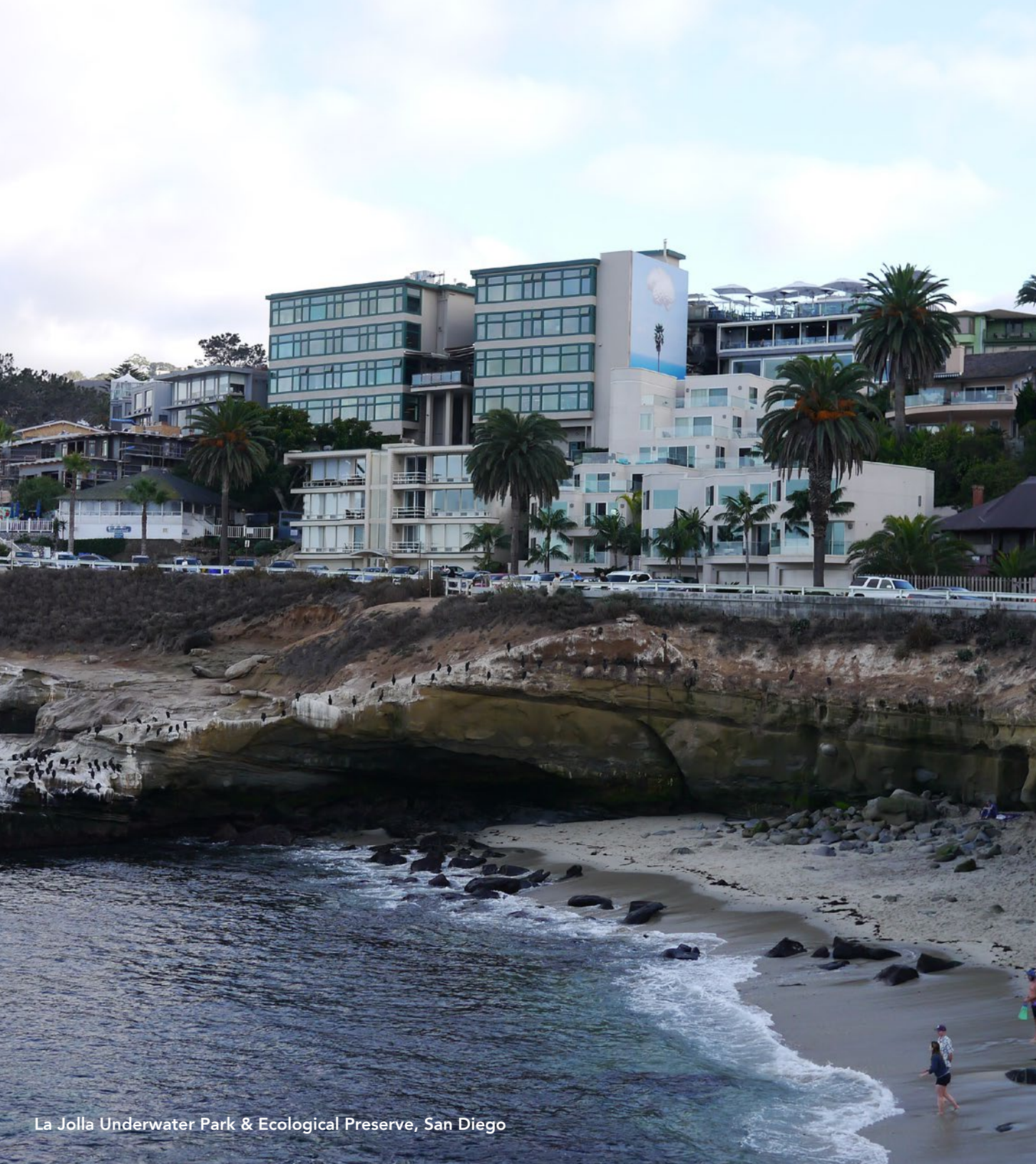
La Jolla Underwater Park & Ecological Preserve, San Diego