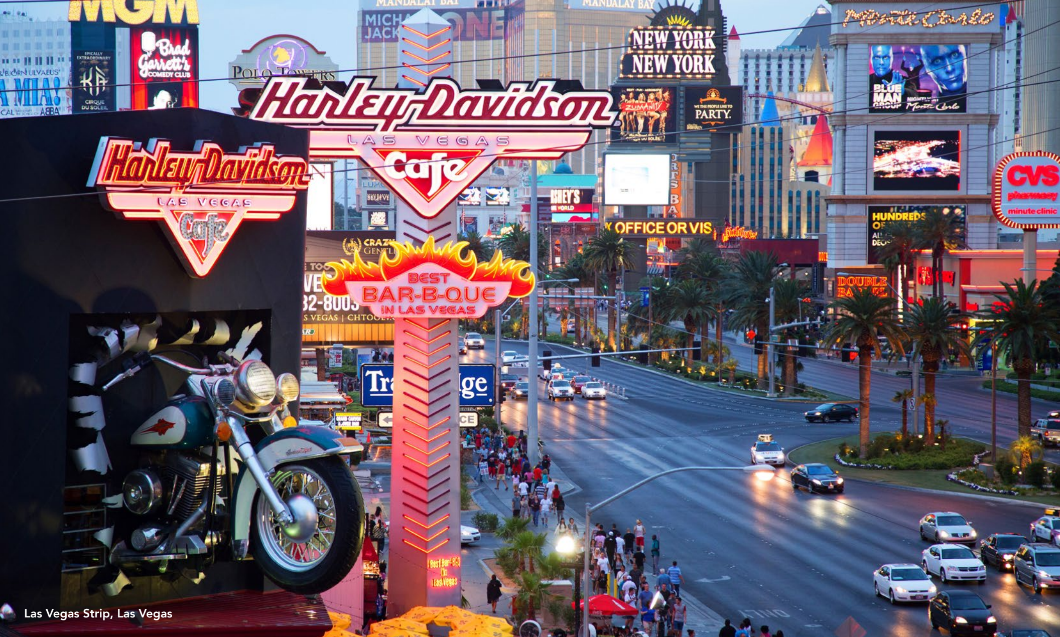
Las Vegas Strip, Las Vegas