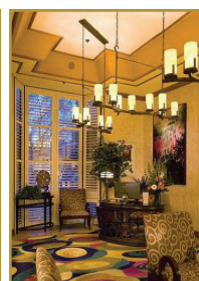
BW Sutter House