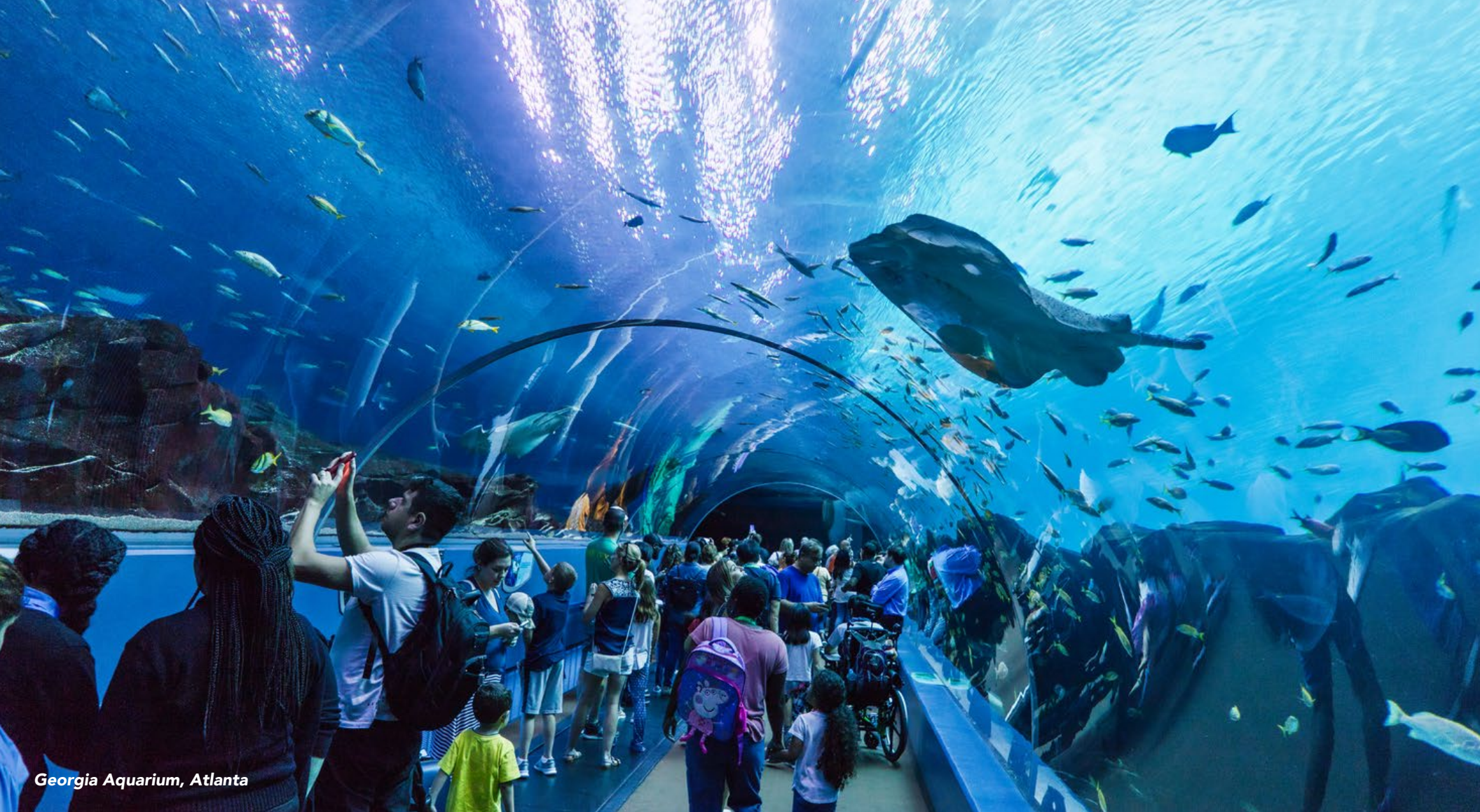
Georgia Aquarium, Atlanta