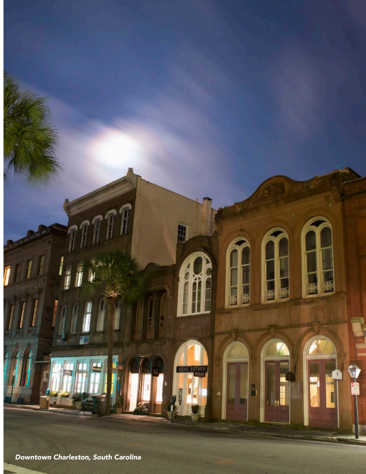
Downtown Charleston, South Carolina