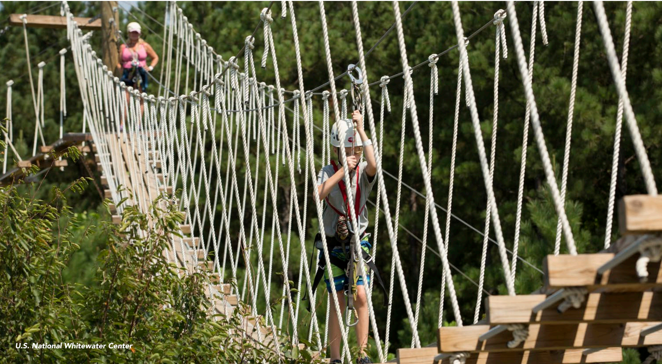
U.S. National Whitewater Center