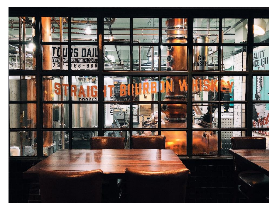
Tarnished Truth Distilling Company, Virginia Beach

Fuel up for your second day at Virginia Beach with breakfast at <u>Commune</u>, a rustic, chic spot serving seasonal New American dishes, many with produce from their backyard garden.