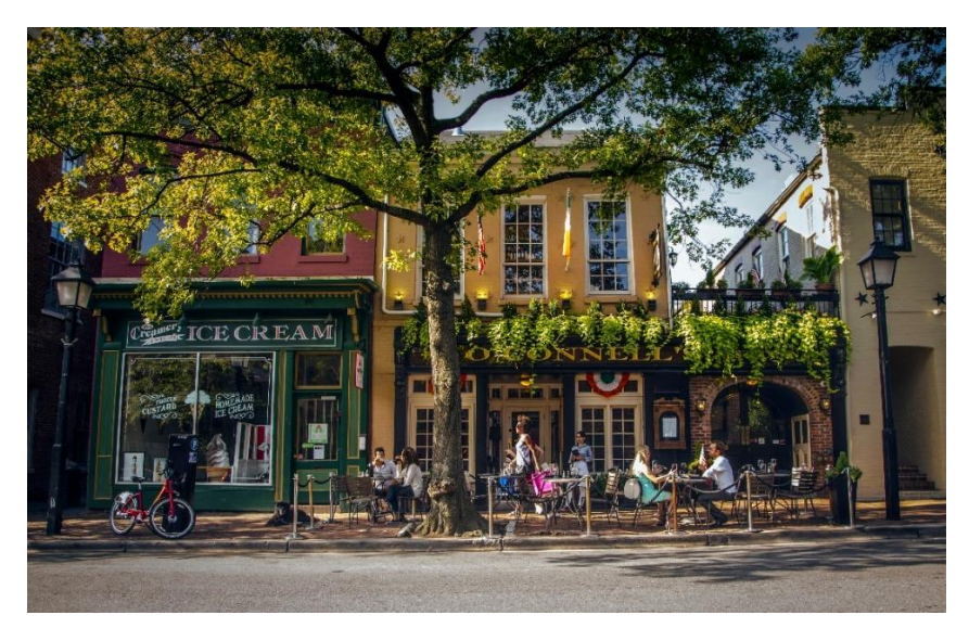
Old Town Alexandria

Start your next morning with breakfast at one of the fine establishments along King Street and the surrounding blocks, such as <u>Fontaine Bistro</u> or <u>Café du Soleil</u>.