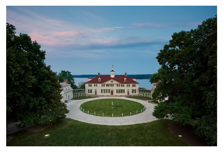
George Washington's Mount Vernon

Take some time out of the day to visit <u>George Washington's Mount Vernon</u>, the famous home of the United States' Founding Father and First President, George Washington. Tour the beautifully restored mansion, four distinctive gardens, and get a glimpse of Mount Vernon's working farm. For a more scenic route, rent a bike from one of the many Capital Bikeshare stations and ride the Mount Vernon Trail along the river to the historic estate.