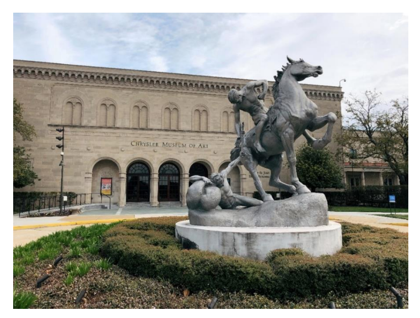
The Chrysler Museum of Art

Walk or rideshare over to the <u>Chrysler Museum of Art</u> which houses an impressive collection of American, European, and contemporary art. Don't miss the glass art collection, featuring works by the famed Dale Chihuly.