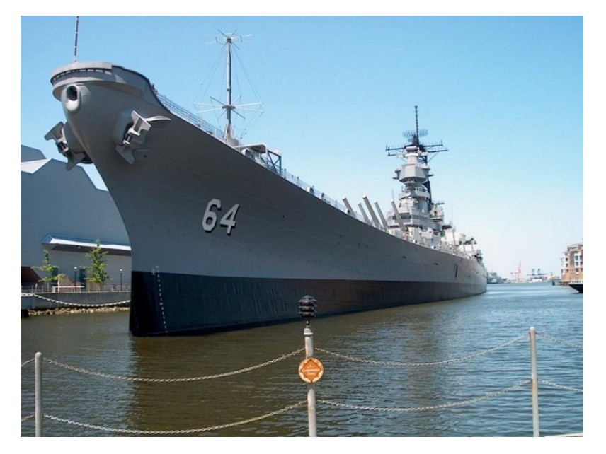
The USS Wisconsin at Nauticus

The city offers many elegant accommodations for the tired traveller. The <u>Hilton Norfolk the Main</u> offers amazing views of the Elizabeth River and Downtown Norfolk with a rooftop bar and restaurant. The boutique <u>Glass Light Hotel &</u> <u>Gallery</u>, part of the Marriott Autograph Collection, features unique glass art throughout.