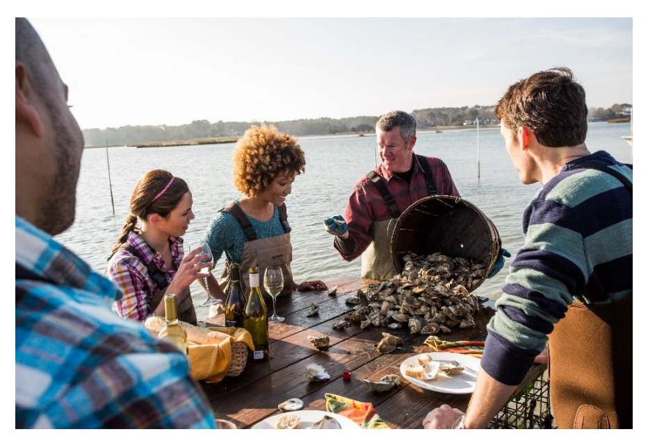
Pleasure House Oyster Chef Table Tours, Virginia Beach

Finish the day exploring the <u>ViBe Creative District</u>, a vibrant and evolving neighbourhood that celebrates arts, culture and creativity. The district is also a food lover's paradise, with a wide array of restaurants, cafes, and breweries offering delicious and innovative cuisine. Try an inspired cocktail at <u>Chesapeake Bay Distillery</u> before delighting in the wood-fired New American cuisine at <u>Hearth</u> for dinner.