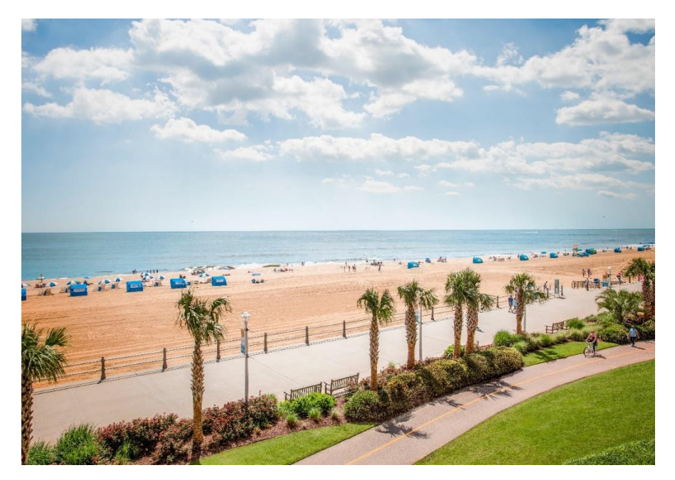
The Virginia Beach Boardwalk

Upon arrival in Virginia Beach, you'll understand why it's considered one of the best destinations on the East Coast with its delightful combination of beautiful beaches, outdoor activities, and a vibrant boardwalk.