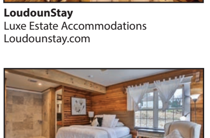
Waterford Reservations Unique Cottages, Cabins, Treehouses Waterfordreservations.com