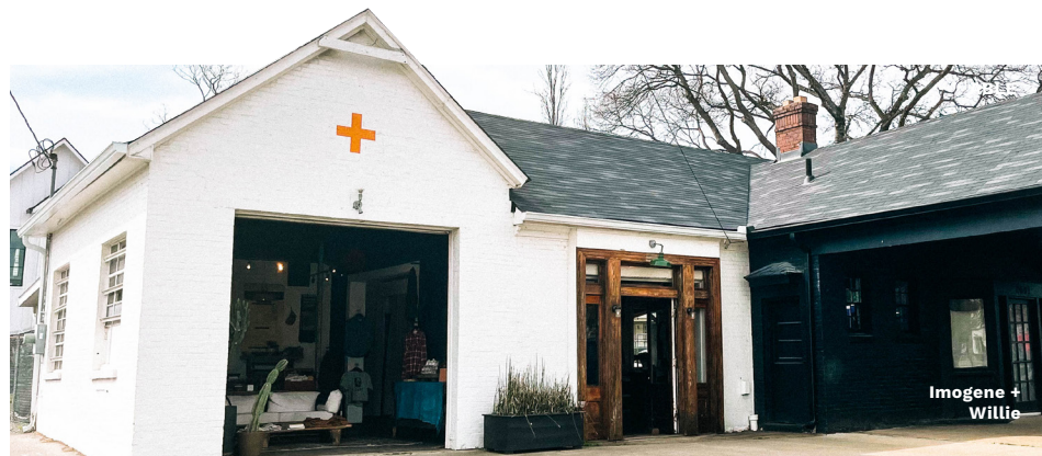
Imogene + Willie