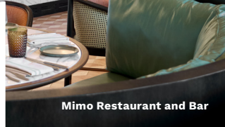
Mimo Restaurant and Bar

Discover the origins of the special stuff that fills our drinks and the food that makes Nashville a unique culinary destination.